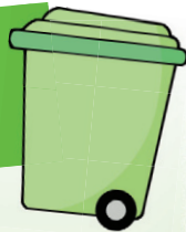
Table scraps and soiled materials...